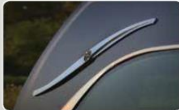
A contemporary painted roof with ornate modern landau bars further enhance the Echelon's sophisticated exterior.