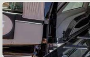
A wide-opening casket door is a standard feature on the Echelon; a custom embroidery panel is also standard.