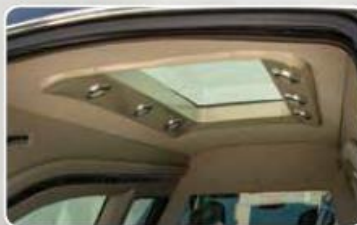
The Echelon comes with a skylight to illuminate the casket compartment.