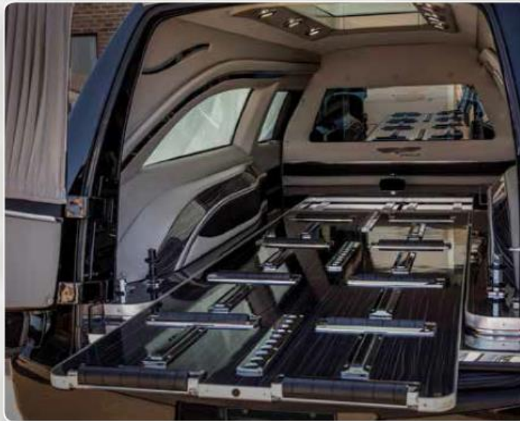
The European styling of Eagle's exclusive Echelon is truly a masterpiece. The Echelon features a true limousine-style rear window, painted top, and glass skylight to naturally illuminate the casket and floral display. (Shown with optional electric Extension Table)

The Cadillac XTS Echelon is also packed with many interior features sure to satisfy the most discriminating funeral homes.