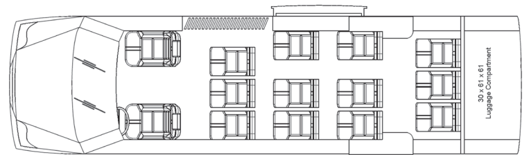
14 Passenger w/ Luggage Executive Shuttle Floor Plan #1