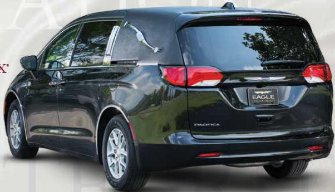
EAGLE PACIFICA LX ® (Shown with optional stainless pillars and opera lights)