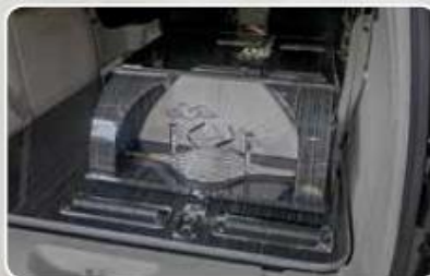
A portable Urn Enclave is also available as a dignified solution for transporting urns.