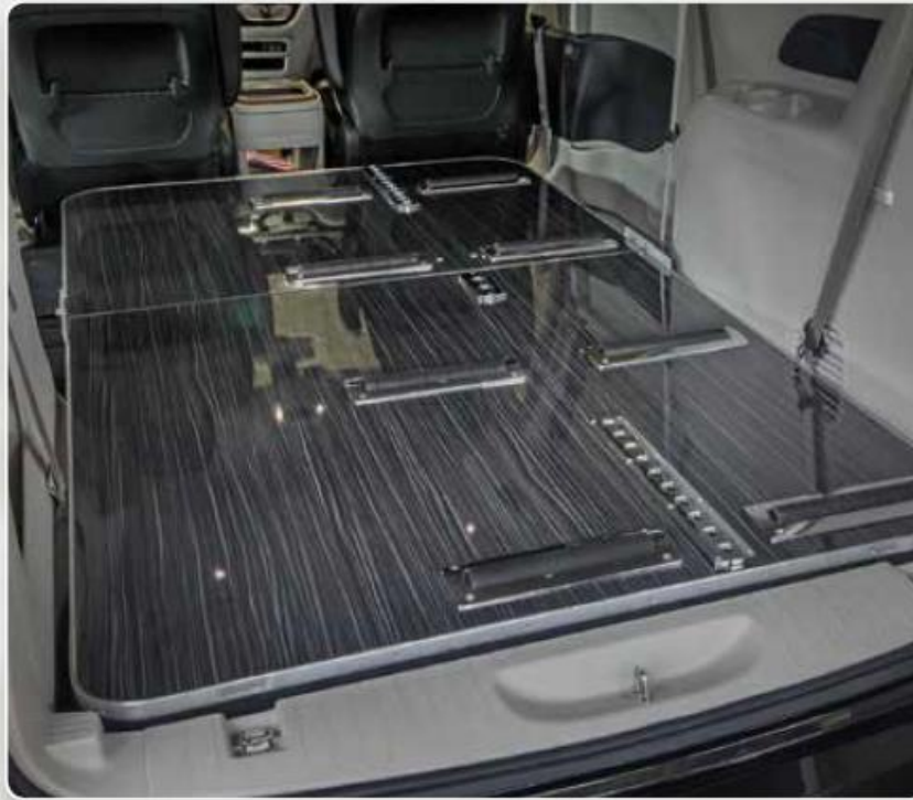
Oversized caskets and shipping containers easily fit into the rear casket compartment.