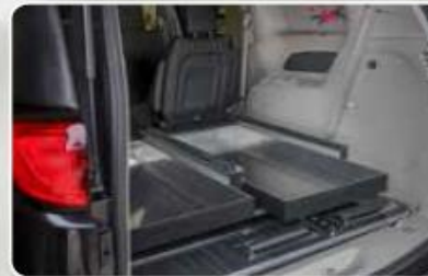
Stow 'N Go® seating and two aluminum floral trays are accessible when the hinged casket floor is folded over.