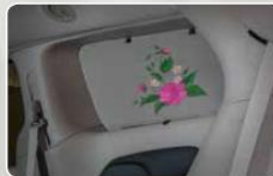
A beautifully-embroidered interior landau panel adds a nice accent to the OEM Chrysler interior for funeral services.