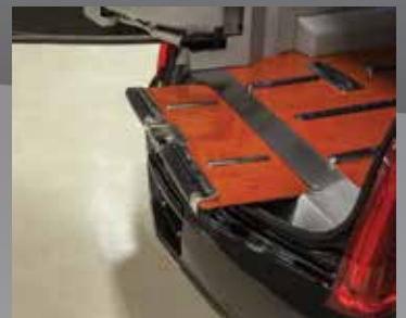
The Majestic boasts our Table Extender / Bumper Protector.