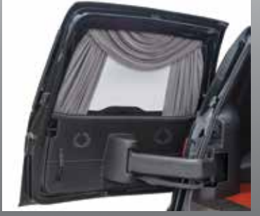
The rear load door is our EXCLUSIVE left- or right-hand Swing-A-Way door.