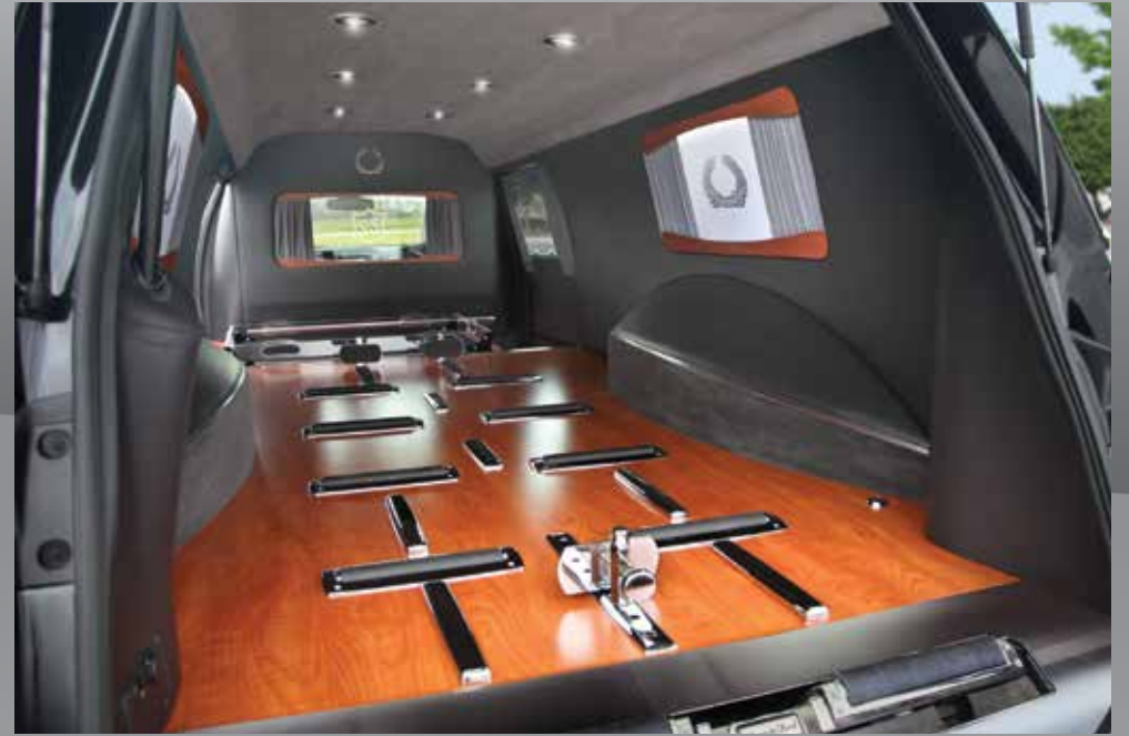
Luxury interior with elegant cherry wood accents and floor.

Due to continuous improvement, Accubuilt reserves the right to change standards and specifications without notice or price adjustment.